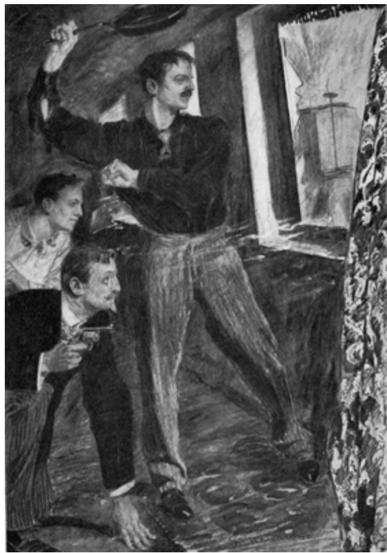
Brissac hurled the skillet like a clumsy discus

Then he sprang afoot, secured his ax, and sent Brissac to the pantry to rummage for other weapons. "A rush is the next thing in order," he suggested; and they prepared as they could to meet it.