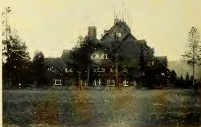
Old Faithful Inn—truly a delightful place