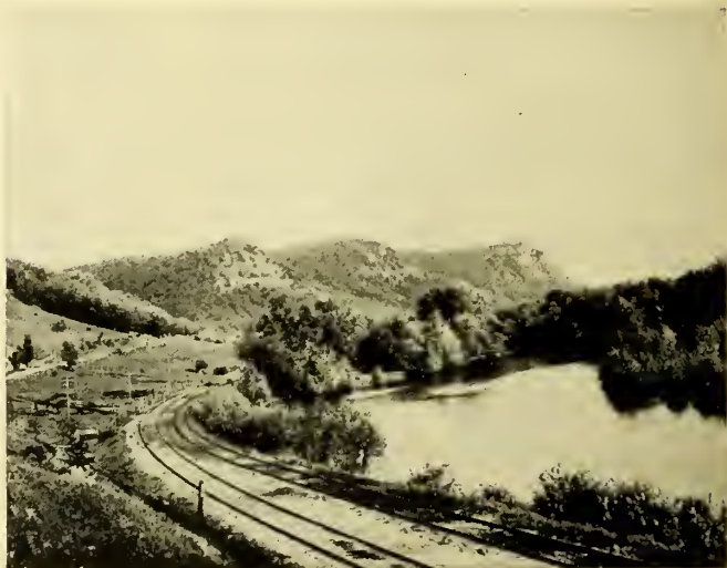
"Three Sisters"—Mississippi River Scenic Line

The Yellowstone Park cars leaving Chicago 9:30 a. m. (on this through Coast train) each Sunday, beginning June 22nd, to and including September 7th, will be under the personal escort of thoroughly experienced excursion conductors, who will accompany the party over the entire trip from Chicago through Yellowstone Park and back to Chicago. The sole duty of these personal representatives will be to relieve passengers of all bother in connection with tickets, baggage and other details, to point out all points of interest, to make the trip a continual round of pleasure, and finally to make reservations for such patrons as may leave the personally conducted party after completion of the Yellowstone Park trip, to go on to the Pacific Coast, Colorado or elsewhere. The schedule of this through service is as follows: