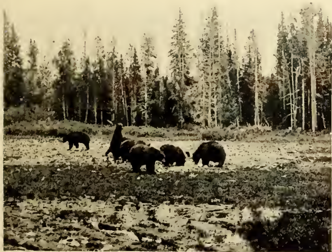
Some of the Park Bears

Billings, the great industrial capital of the Yellowstone Valley is soon reached, and presents a surprise in its size and progressiveness. One hundred and fifteen miles beyond Billings is Livingston. A