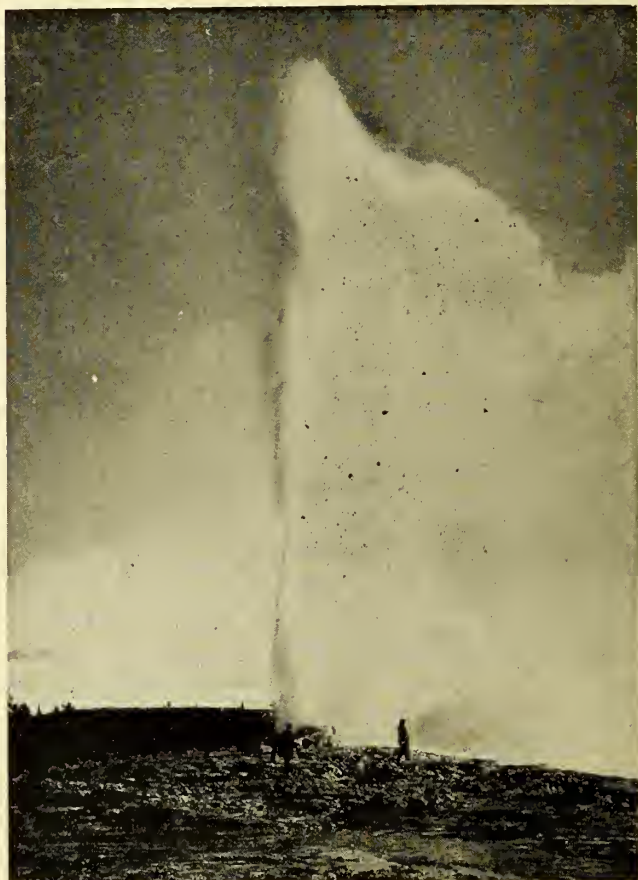
Old Faithful Geyser—which shoots forth more than a million gallons of water every hour for the entertainment of Park tourists