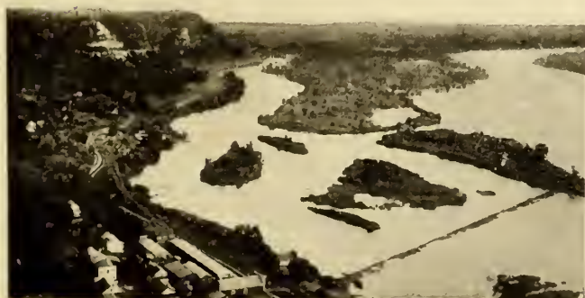
River, Islands and Bluffs at De Soto, Wis.

The equipment of the North Coast Limited includes new latest model standard and tourist sleeping cars, dining car (service a la carte), and observation-library car, with barber and bath from Livingston to St. Paul. The Burlington's Oriental Limited, from St. Paul to Chicago, also provides dining car and observation-compartment sleeping car.