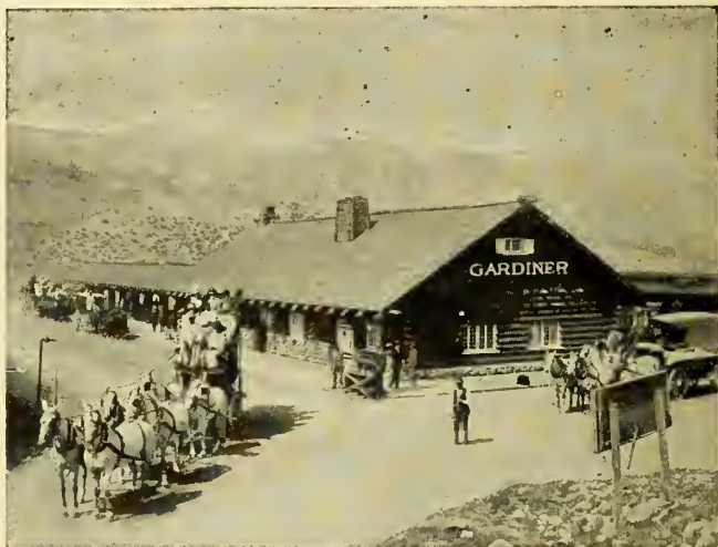
The Unique Log Depot at Gardiner

Of the Twin Cities, St. Paul, beautifully located on a series of hills overlooking the river, is reached first. Within its borders are many attractive parks. Here is located Minnesota's magnificent $4,000,000 State Capitol Building, than which there is none more beautiful. Minneapolis is quickly