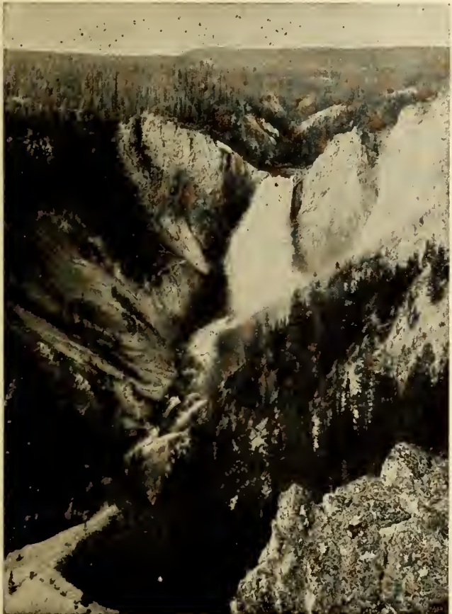
Lower Falls and a Portion of the Grand Canyon—a scene which no tongue or pen can fittingly describe