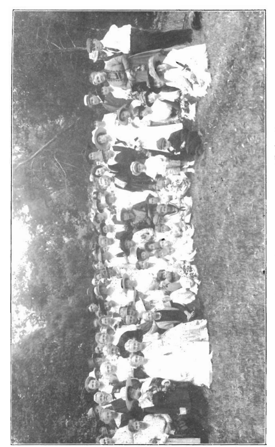
St. Louis Frisco Women's Safety League on outing at Crystal City June 14.