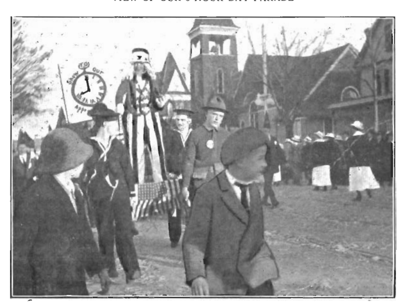
ENDICOTT, JOHNSON & COMPANY

Makers of Leather and Leather Shoes Endicott, New York "We make Good Shoes at Reasonable Prices"