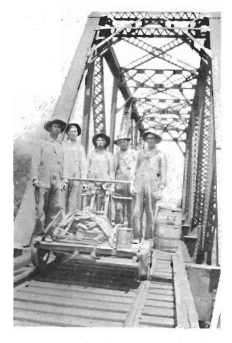
Fulton, Kan. Section Gang, taken on Little Osage River Bridge.